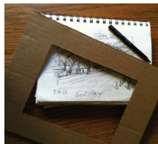
Sketch pad, pencil & view finder. Important.