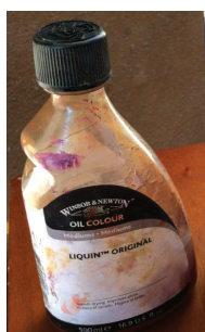
Liquin is a medium that makes paint more workable without diluting color & speeds drying. I use Liquin specifically for my plein air underpainting. Very important.