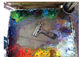
My Masterson Palette - heavy, cumbersome & I won't go anywhere without it. Get a piece of glass to fit and put warm gray or brown paper bag under it. You will need a paint glass scraper. If you buy the paper palattes to go inside of your Masterson - BUY the GRAY not the white. Fighting white is too hard when mixing correct color.