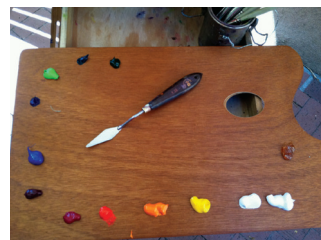
Wood palettes are made for ease & store inside the French easel even with the paint still on them. I personally like more space. There is no right or wrong on this.