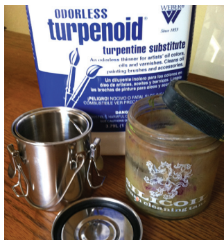
Turpentine holders & the odorless turpentine.